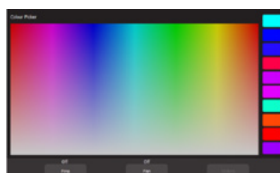
Colour Picker Screen